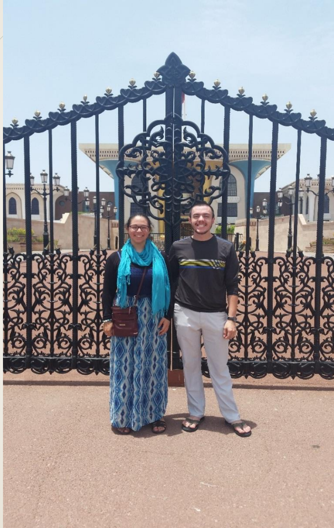
Sultan Qaboos Palace