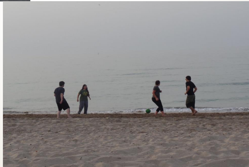
Soccer on the beach