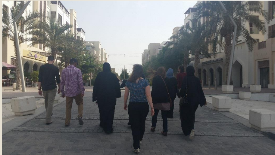
Coffee with Omani friends