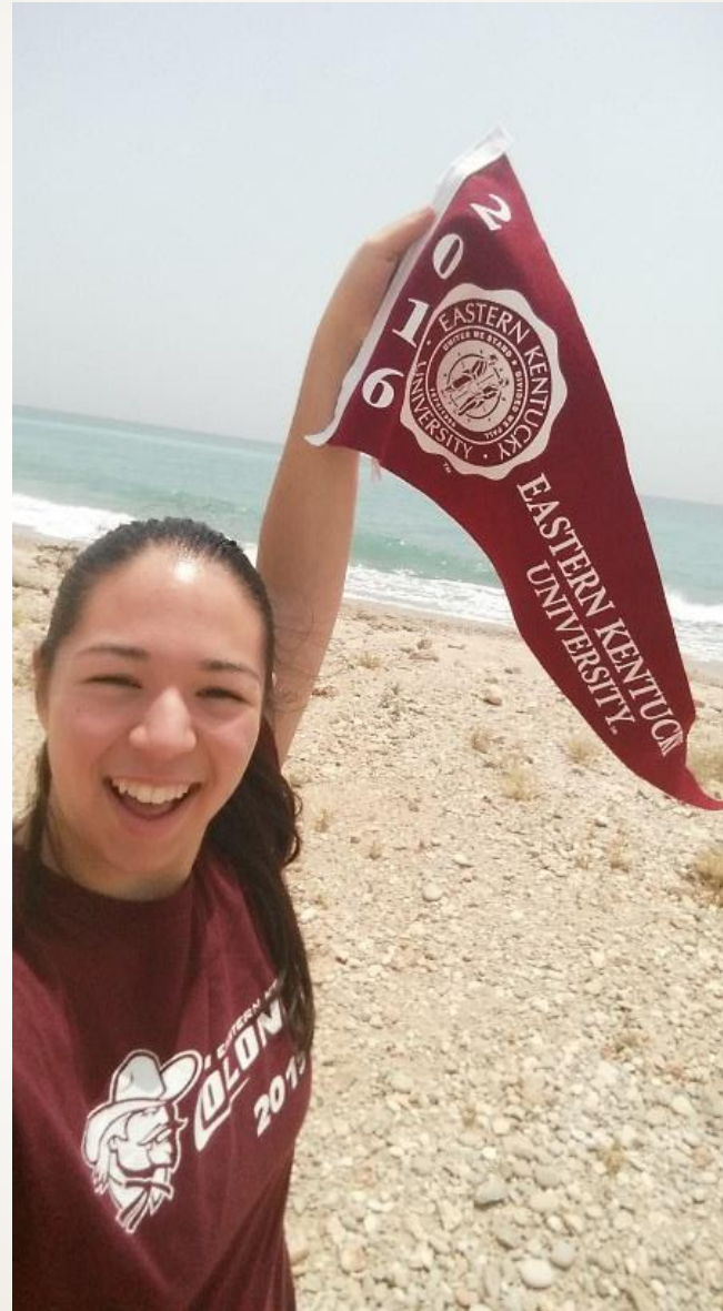
The Gulf of Oman