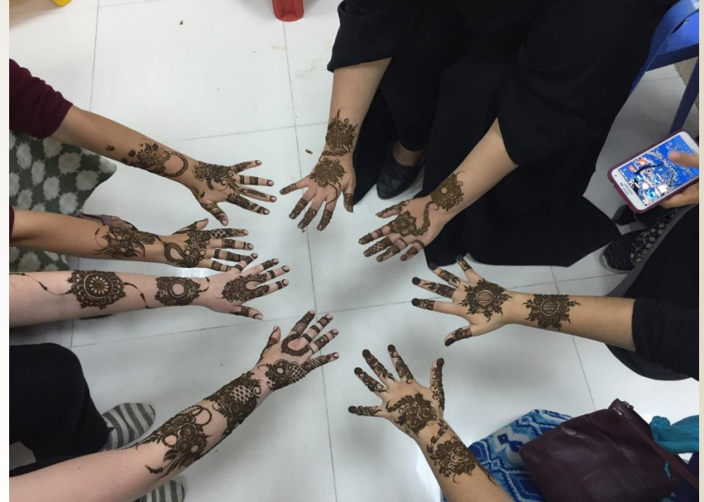
Henna with friends