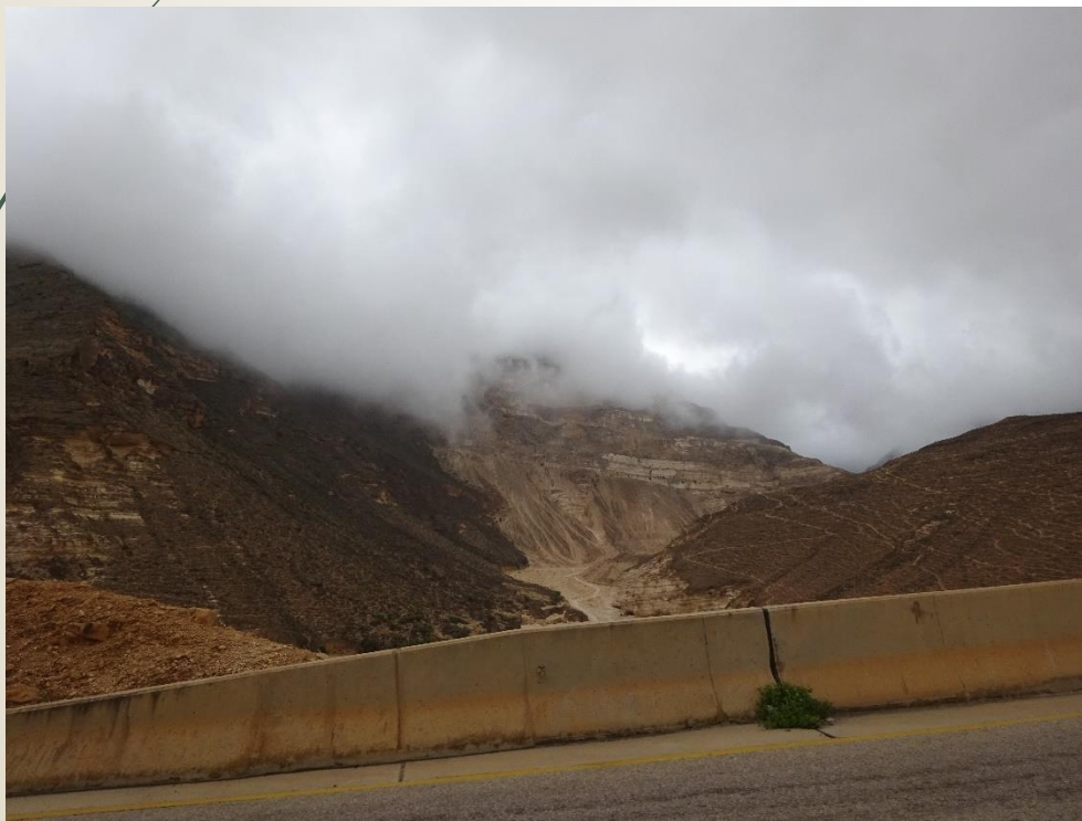
Dhalkut, near Yemen