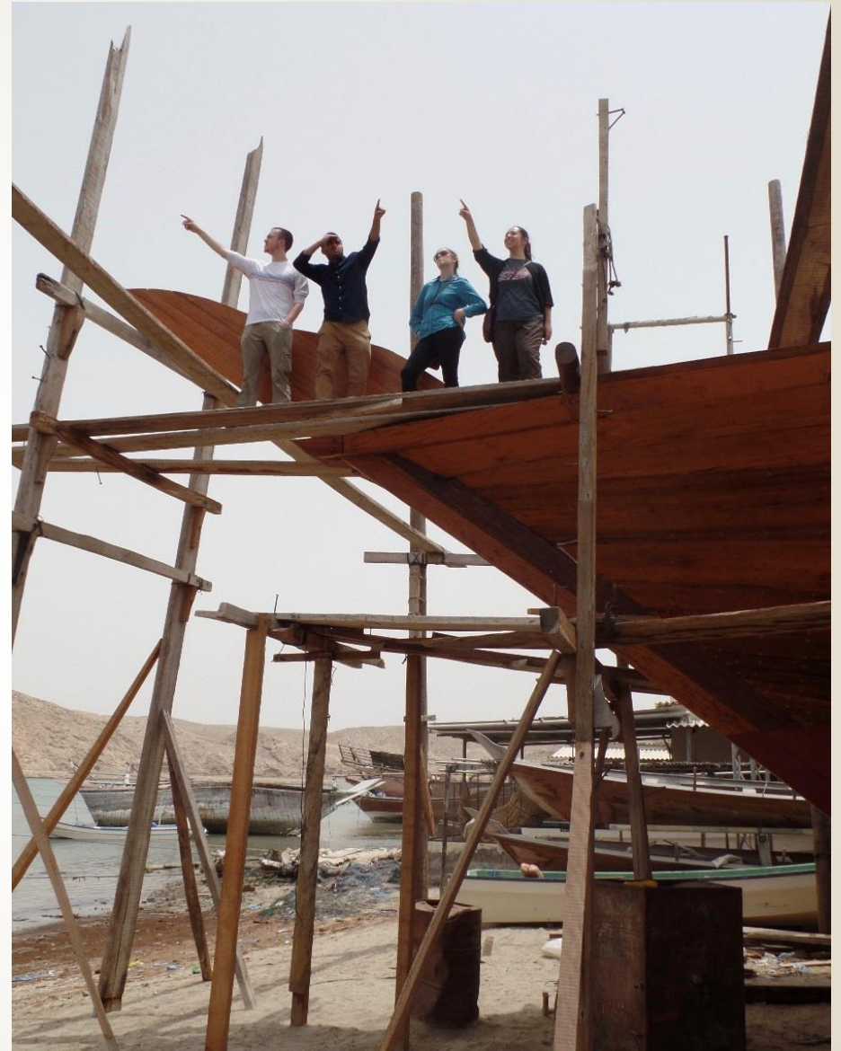
Sur Boat Factory